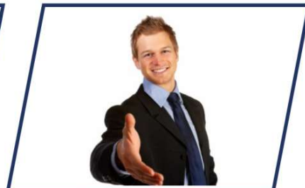
SALES & MARKETING