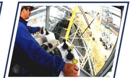
HEAVY CRANE OPERATORS